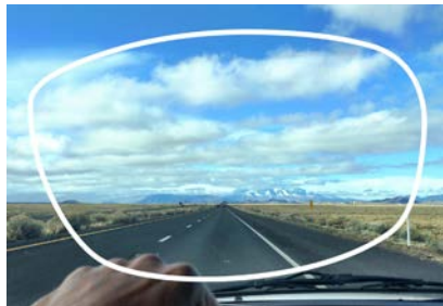
Traditional Photochromic (Responds to UV light only)